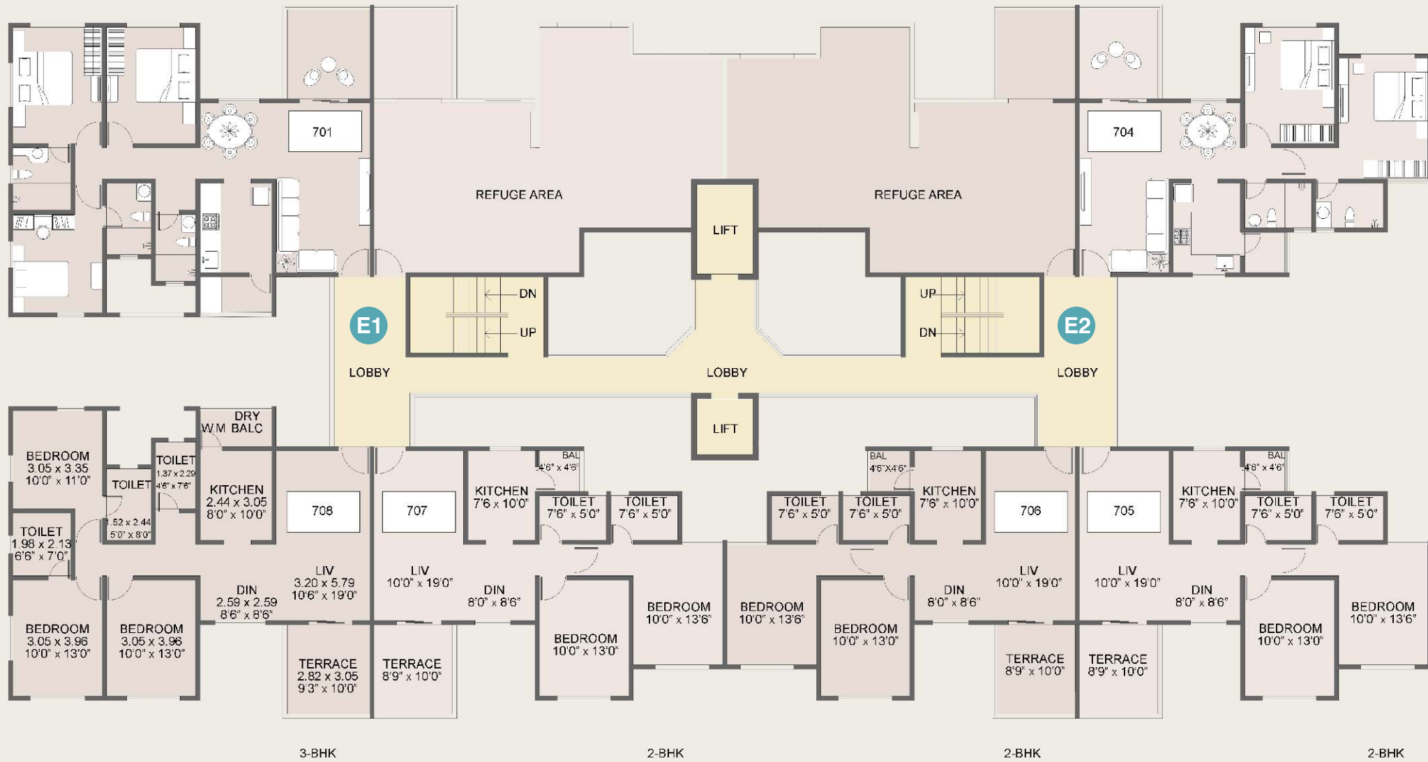
SALEABLE AREA STATEMENT